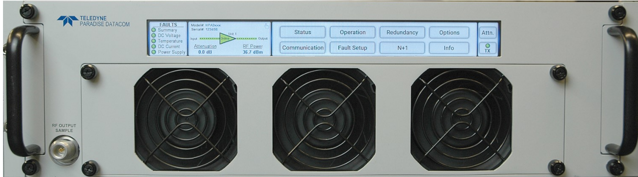
3RU SSPA Chassis with Touchscreen Display

Teledyne Paradise Datacom's Indoor 3RU Solid State Power Amplifiers represent the latest in High Power Microwave Amplifier Technology. The SSPA chassis achieves the highest power density in the industry along with enhanced maintainability.