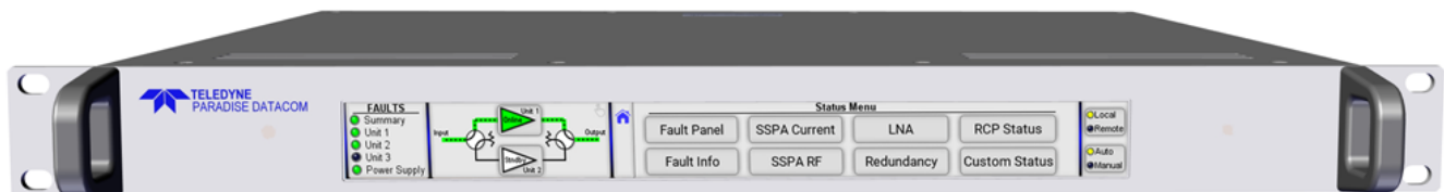
Redundant System Controller Configured for 1:1 Redundant Mode

The 1RU system controller provides an extremely user friendly interface for complete monitor and control of the amplifier system.