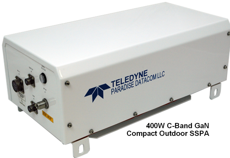
400W C-Band GaN Compact Outdoor SSPA