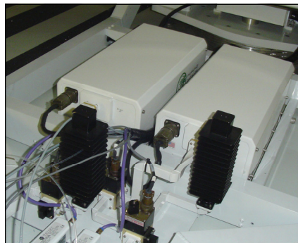
SNG-mount 1:1 system w/ side-mount AC input