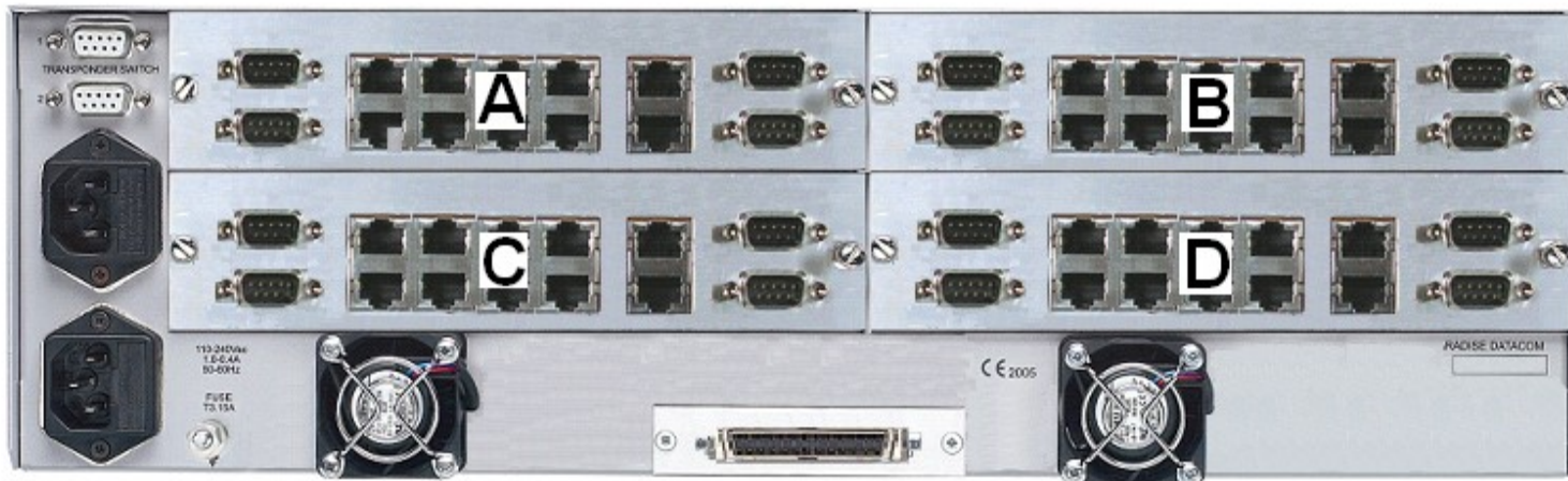
Rear view of PDQS 1:N Redundancy Switch

A P3717 1:N card for the backup modem (to communicate over the umbilical cable to the switch) must be ordered as an interface option when placing the backup modem order.