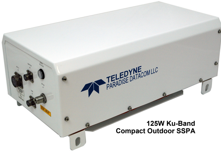
125W Ku-Band Compact Outdoor SSPA