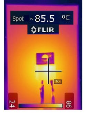
Measured Peak 85.5 °C

Test Structures with 6.7W Dissipation Devices