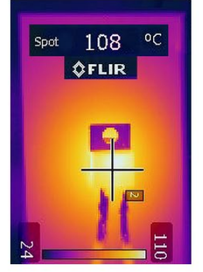
Measured Peak 108 °C