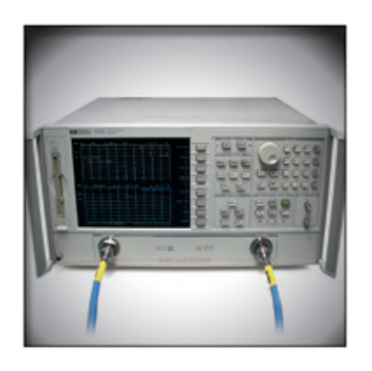
Test Equipment / Systems