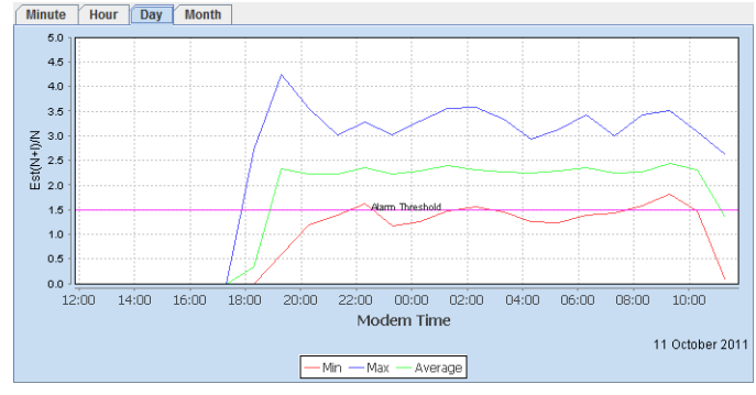
Interferer Power Level Monitoring showing the effect of interference over time.

Teledyne Paradise Datacom LLC 328 Innovation Blvd., Suite 100 State College, PA 16803 USA Tel: 1 (814) 238-3450