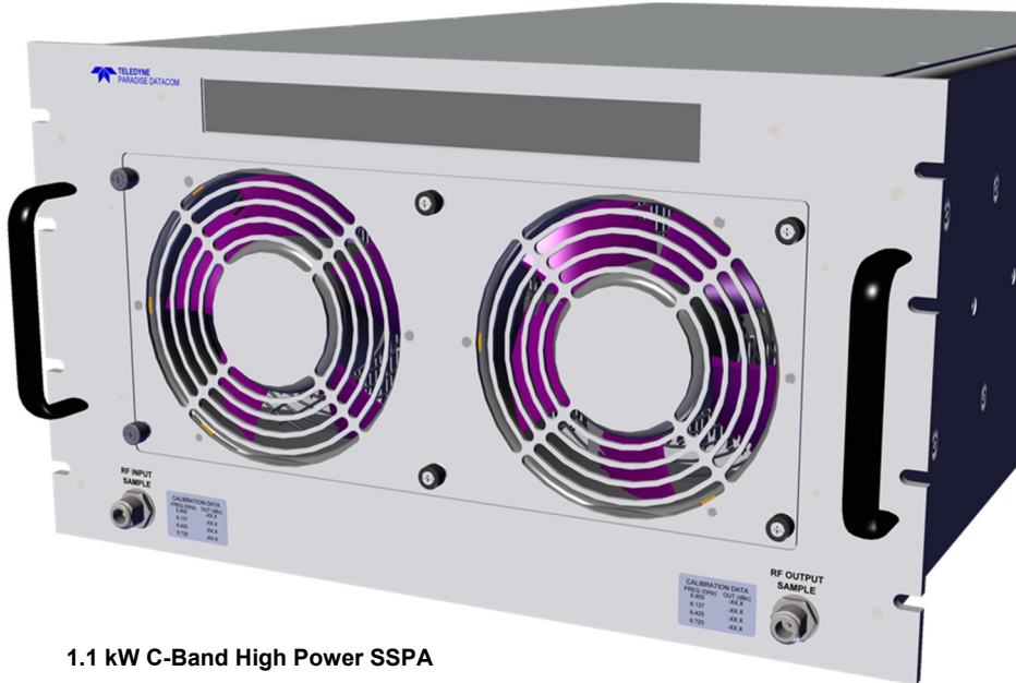
1.1 kW C-Band High Power SSPA