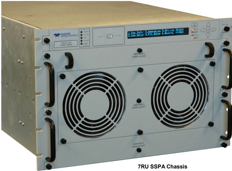
7RU SSPA Chassis