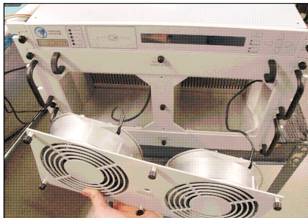
Field Replaceable Fan Assemblies

Front and rear fan assemblies are also field replaceable without taking the amplifier offline. The ability to remove the fan trays makes it easy to perform regular inspection and cleaning of the heatsink fins.