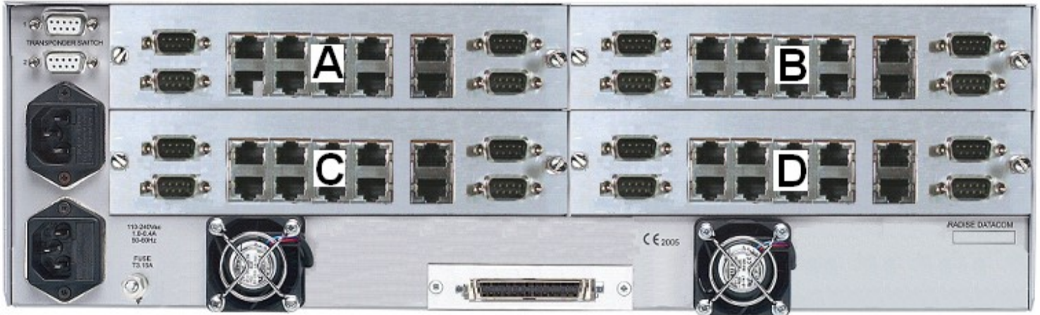
Rear view of PDQS 1:N Redundancy Switch

A P3717 1:N card for the backup modem (to communicate over the umbilical cable to the switch) must be ordered as an interface option when placing the backup modem order.